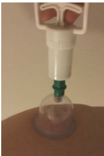
Fig. 1—A view of vacuum application by dry cupping

included movements from external to inner thigh, and vice versa with a transverse direction. So, the second phase of the massage included external and anterior parts of the thigh. Following completion of massage for anterior thigh, subjects turned to prone position. The same procedure was applied for the posterior thigh. Following the completion of right thigh, the same steps were implemented on left thigh. Duration of cupping application for each thigh was 15 minutes and a total of 30 minutes for both legs. All cupping procedures were applied by physicians certificated by the British Cupping Society and Natural Health Institute 20 .